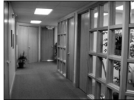
Commercial Flush Doors