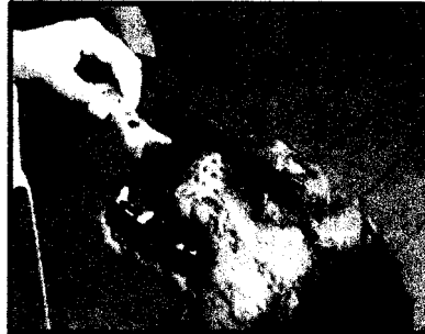
To Tiger, our Chief Taste Tester and Second in Command